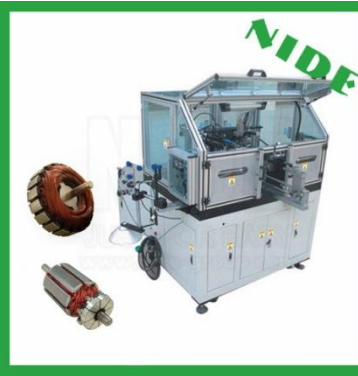
Armature winding machine