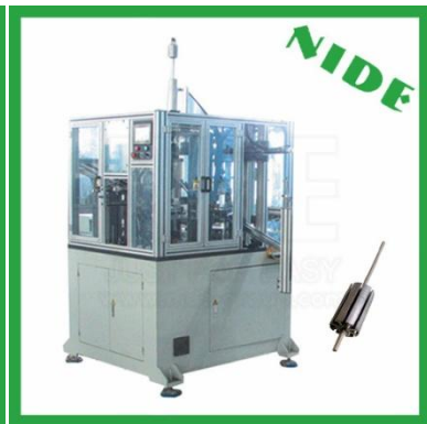
Commutator pressing machine