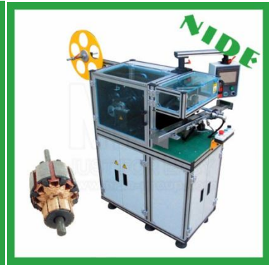
Wedge inserting machine