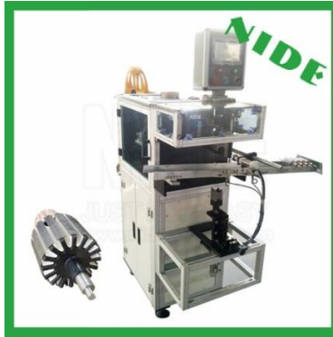
Paper inserting machine