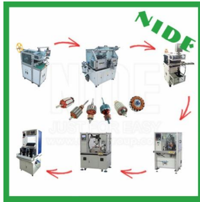
Rotor assembly line without belt