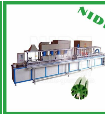
Powder coating machine