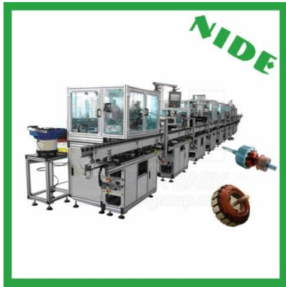
Rotor assembly line with belt