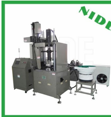
Rotor die-casting machine