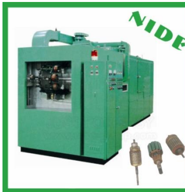
Armature varnish machine