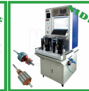
Rotor testing machine