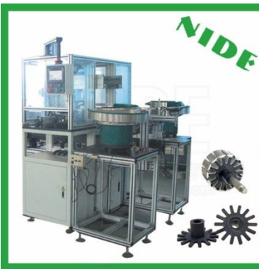
End cover pressing machine