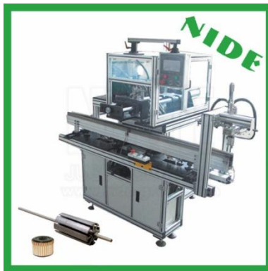
Shaft inserting machine