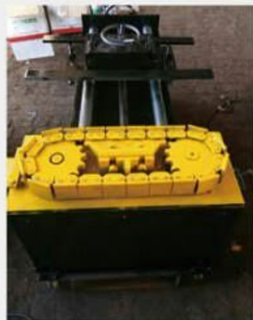
Manual flanges marking machine