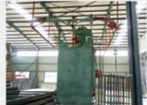
Shot blasting up to 24 inch