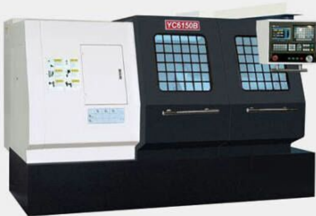
CNC Lathe machine: For flanges and pipe fittings machining