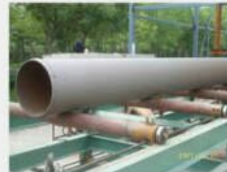
Pipe shot blasting