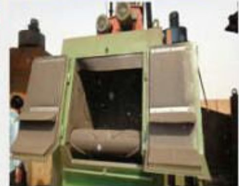
Shot blasting up to 6 inch