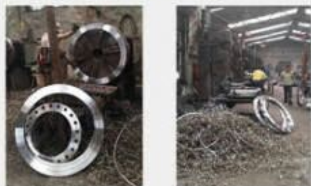
Flange lathe machine Flange drill machine