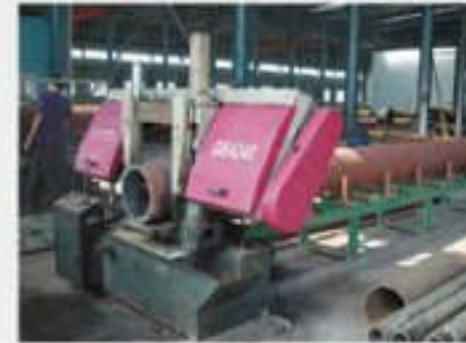
Straight cutting machine