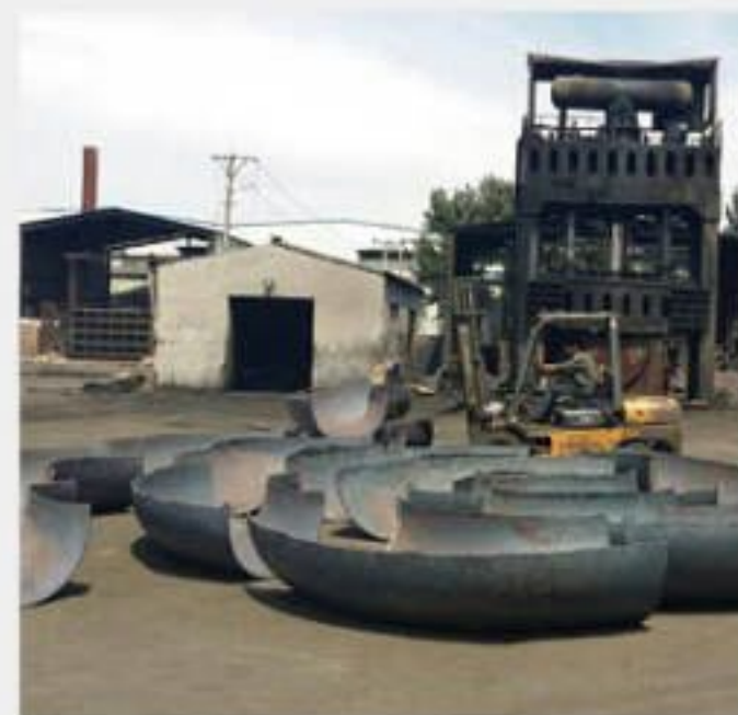
Two half elbow machine