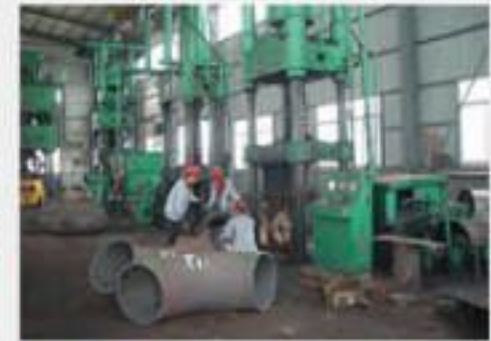
Part elbow sizing machine