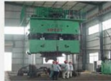
Full elbow sizing machine