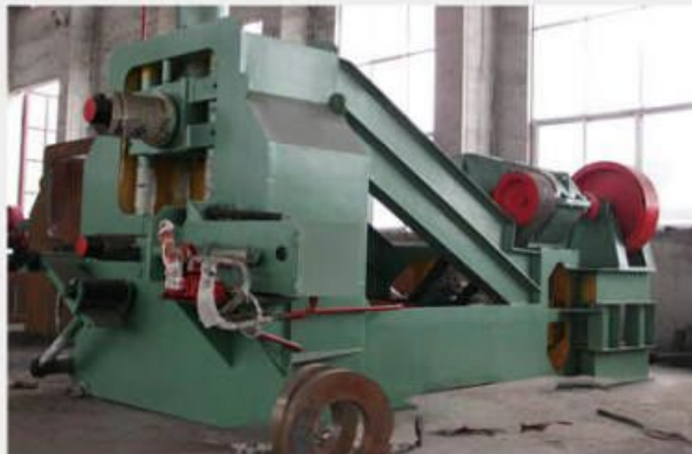
Ring rolling machine: for ring, flanges production, make small size diameter to big size diameter,max OD3000mm