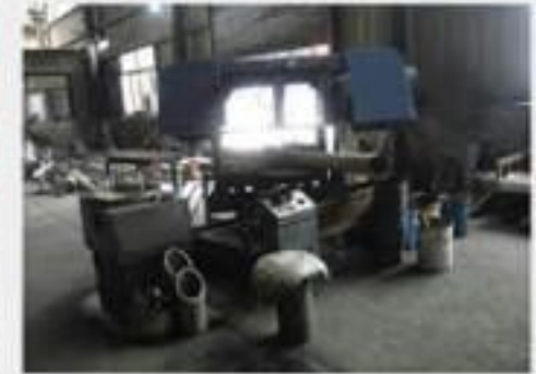
Angle cutting machine