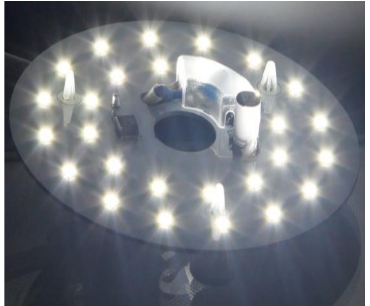
9W LED module lighting diagram