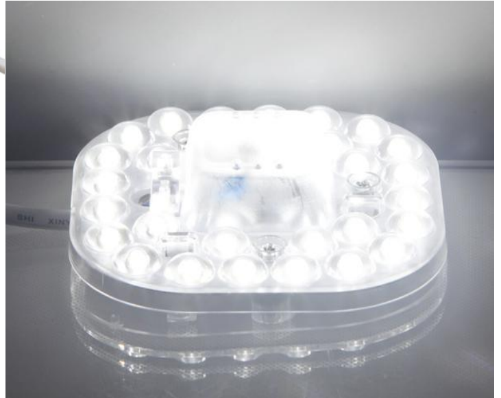
10W LED module lighting diagram