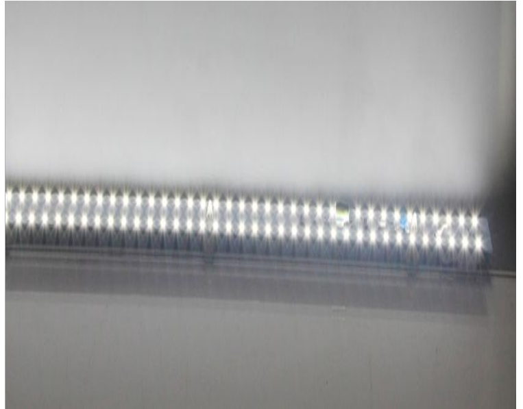
9W LED module entity diagram