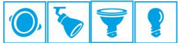
down light spot light par lamp bulb