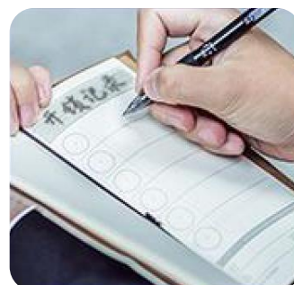
Hard to trace the record