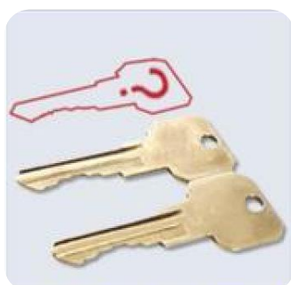
Key may get duplicated