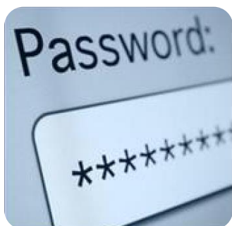
Password may get forgot