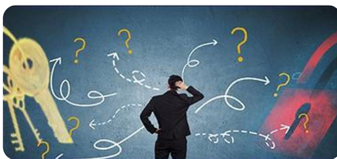
Mass and complicated key/password management