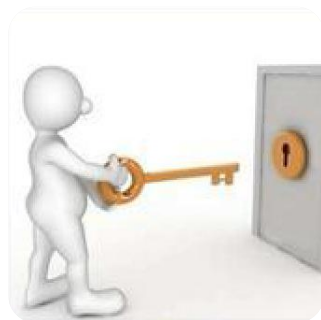
Unlock without authorization