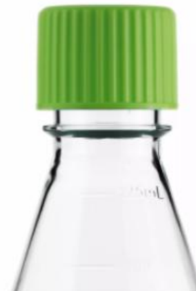
Nice Sealing No Leakage

media bottles with unique and accurate spiral cap design avoids liquid leakage. It can withstand coke inversion test.