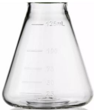
Accurate Containing Mark