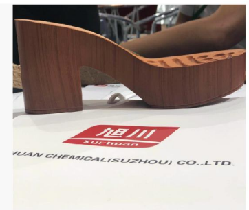
Lady's high heel shoes