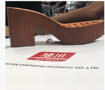
Lady's high heel shoes