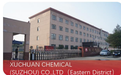
XUCHUAN CHEMICAL (SUZHOU) CO.,LTD (Eastern District)