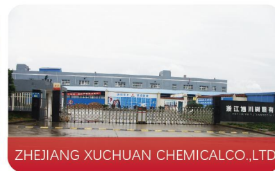
ZHEJIANG XUCHUAN CHEMICAL CO.,LTD