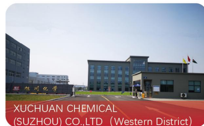
XUCHUAN CHEMICAL (SUZHOU) CO.,LTD (Western District)