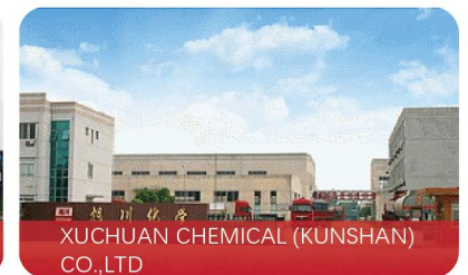
XUCHUAN CHEMICAL (KUNSHAN) CO.,LTD