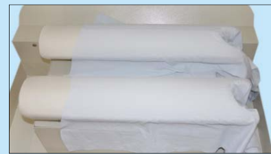
工作中 In Operation