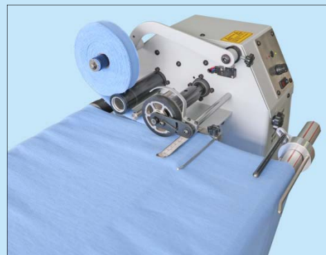
操作中 In operation