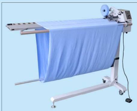
布匹擺放示意圖 Cloth Placement Diagram