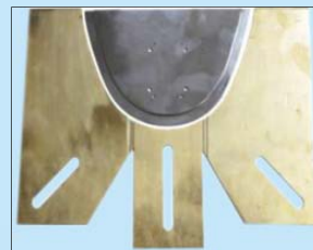
龜背模 Back patch template