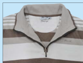
效果圖 T-shirt with back patch