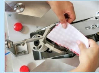
切領咀、反領操作 Collar tip trimming and turning