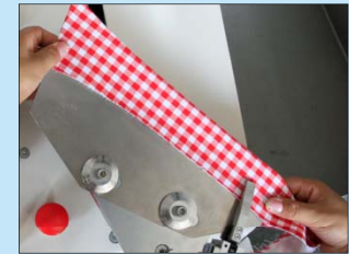
機械夾夾緊領 Automatic clamp fixing collar