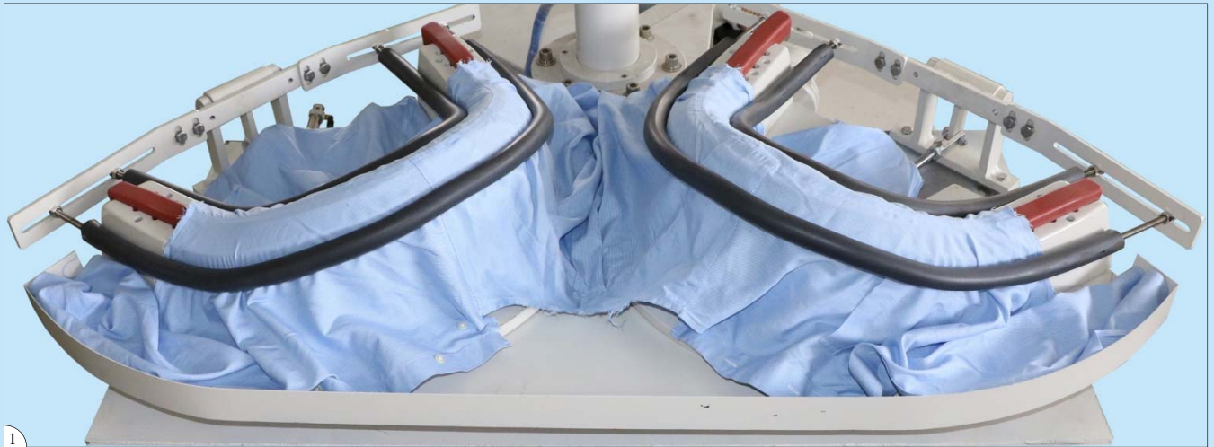
雙袖山縫可同時鋪料及粘合壓熨 Double armholes can be laid, fused and pressed simultaneously