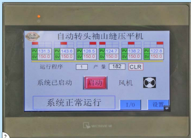
PLC可編程控制器控制及人性化操作界面觸摸顯示屏 操作 Adopt PLC and human friendly touch screen for operation