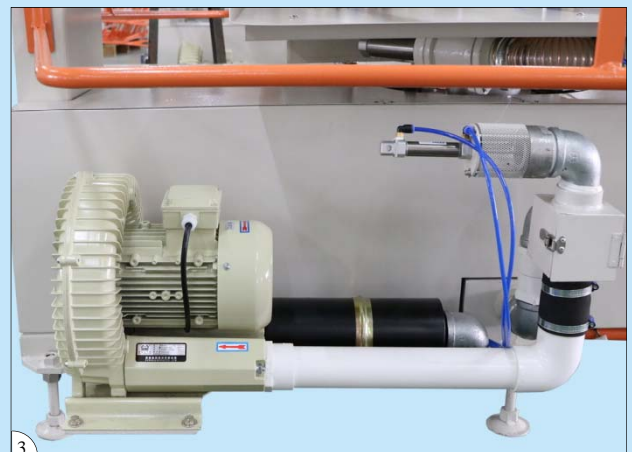
獨立真空泵，有助衣物定位，冷卻、定型效果 Independent vacuum pump facilitates garment positioning, cooling and shaping