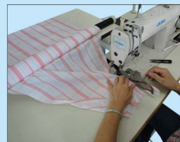
工作中 In Operation