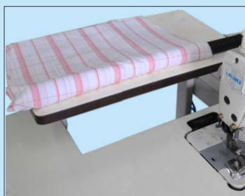
氣動夾布 Pneumatic clamping fabric