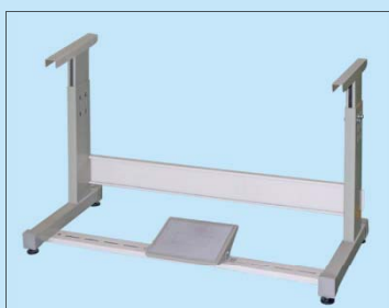
L-型車腳架 L-shaped stand

Large table, small table and L-shaped stand