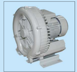
抽風泵，適用於 NS-521-B和NS-522-B Vacuum pump, for NS-521-B & NS-522-B