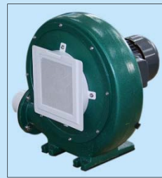
鼓風機，適用於 NS-521-A和NS-522-A Blower, for NS-521-A & NS-522-A