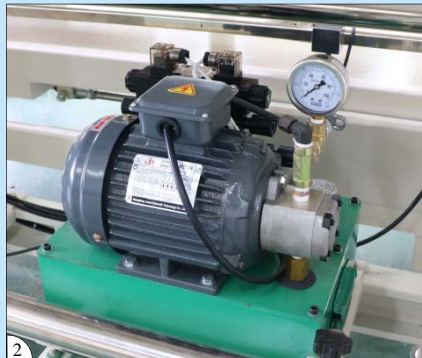
自動追蹤對邊裝置 Automatic Edging Track Device