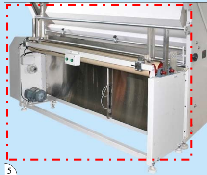
自動鬆布系統 Automatic Fabric Loosening System