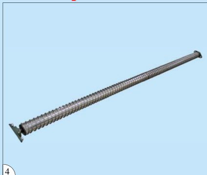
自動展布系統 Automatic Fabric Spreading System