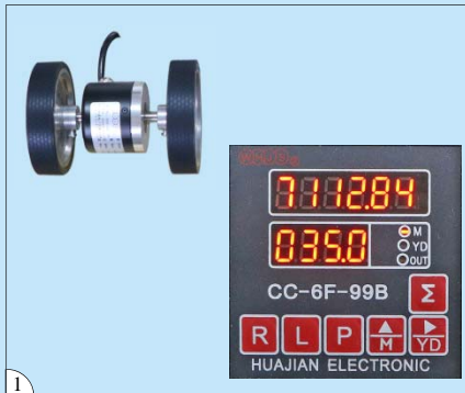
電子計數表(可米/碼轉換) Electronic Meter(Meter/Yardage Switchable)