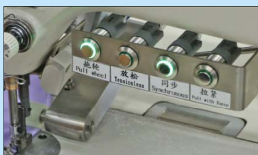
O-D-10-01 三段速度控制系統 3-stage speed control system