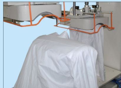
雙模操作 Operation with Double Bucks