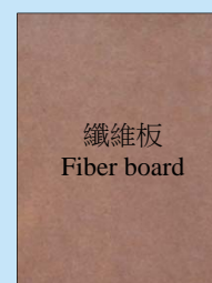
纖維板 Fiber board