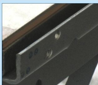
Z 形路軌(選購件) Z track (Optional Accessories)