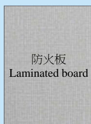
防火板 Laminated board