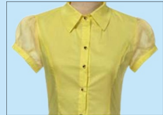
公主褶效果相 Appearance of princess seam on shirt