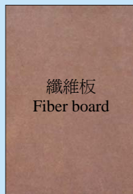
纖維板 Fiber board