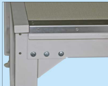
不銹鋼摺板包邊作傍位 Stainless steel curved plate as guide