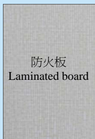
防火板 Laminated board