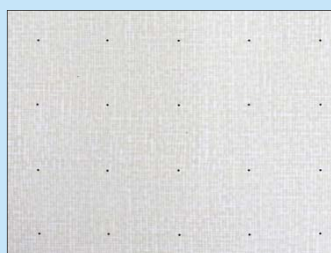
台面風孔 Table air hole