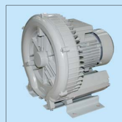
抽風泵，適用於 NS-521-B和NS-522-B Vacuum pump, for NS-521-B & NS-522-B