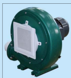
鼓風機，適用於 NS-521-A和NS-522-A Blower, for NS-521-A & NS-522-A