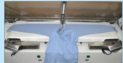
工作示意圖 In working