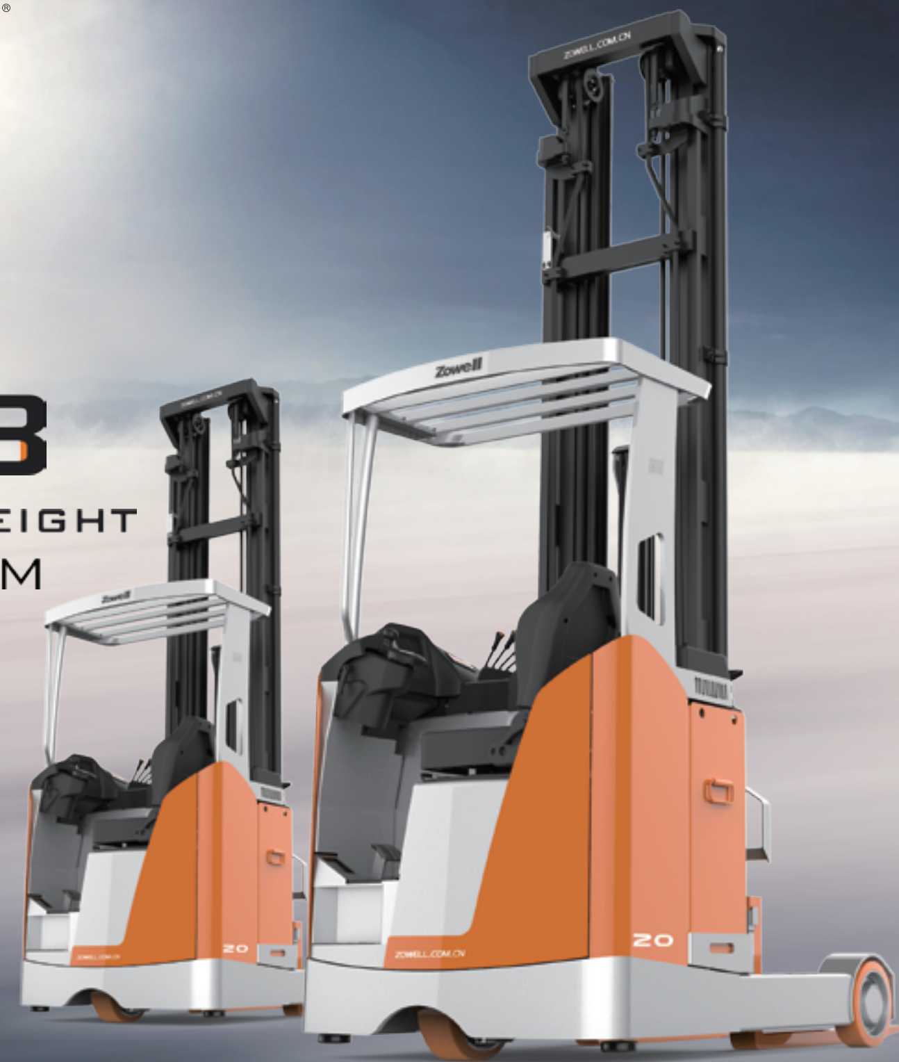
电动前移式叉车系列 Electric Reach Truck Series