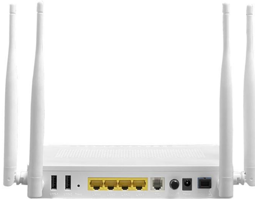
Picture 2-1 GN41AC product figure