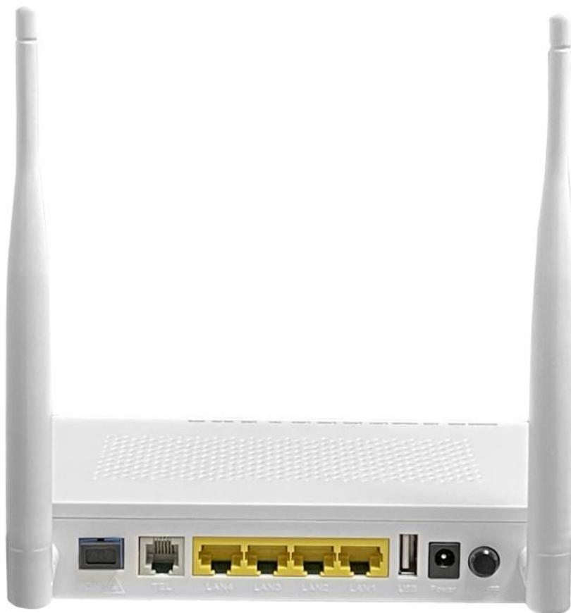
Picture 2-1 XN41N product figure