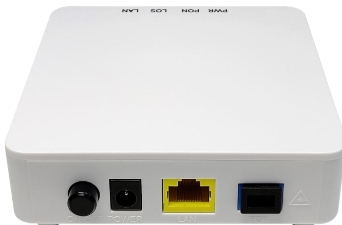
Picture 2-1 EN10 product figure