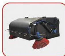
除尘机 Dust Collector

The loading sails produced by our company can be equipped with digging anti sail, container fork, grabbing fork, connecting beard device, snow shovel side tipping bucket, grabbing fork, wheat straw fork, Yige fork and other optional parts to meet the requirements of various working conditions.