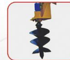
挖坑机 Earth auger