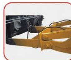
接臂装置 The arm device