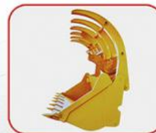
斗叉 Bucket fork