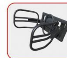
抱夹 Hold clamp