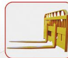
集装箱叉 Container fork