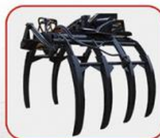
旋转叉头 Rotating fork