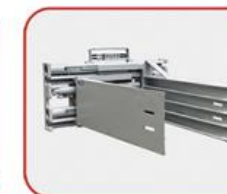
直板抱夹 Straight clamp