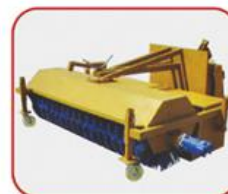
扫地机 2 Sweeping machine 2