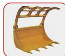
抓纸叉 Scratch paper fork