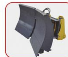
推雪铲 2 Push snow shovel 2