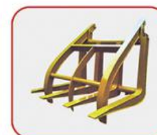
麦草叉 Wheatgrass fork