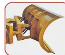
推雪铲 1 Push snow shovel 1