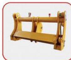
快换装置 Quick change device