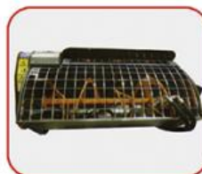
搅拌斗 Stirring bucket