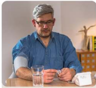
People with chronic diseases