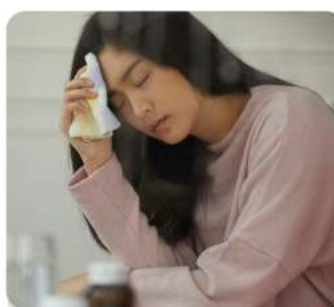
People who are susceptible to disease