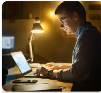
People exposed to various radiation sources