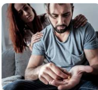
Long-term medication treatment