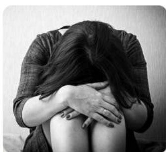
People with low spirits