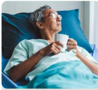
Patients with oncological diseases

We can customize other kinds of mushroom powder blends according to customer needs, as well as OEM customized packaging and hard capsules and tableting.