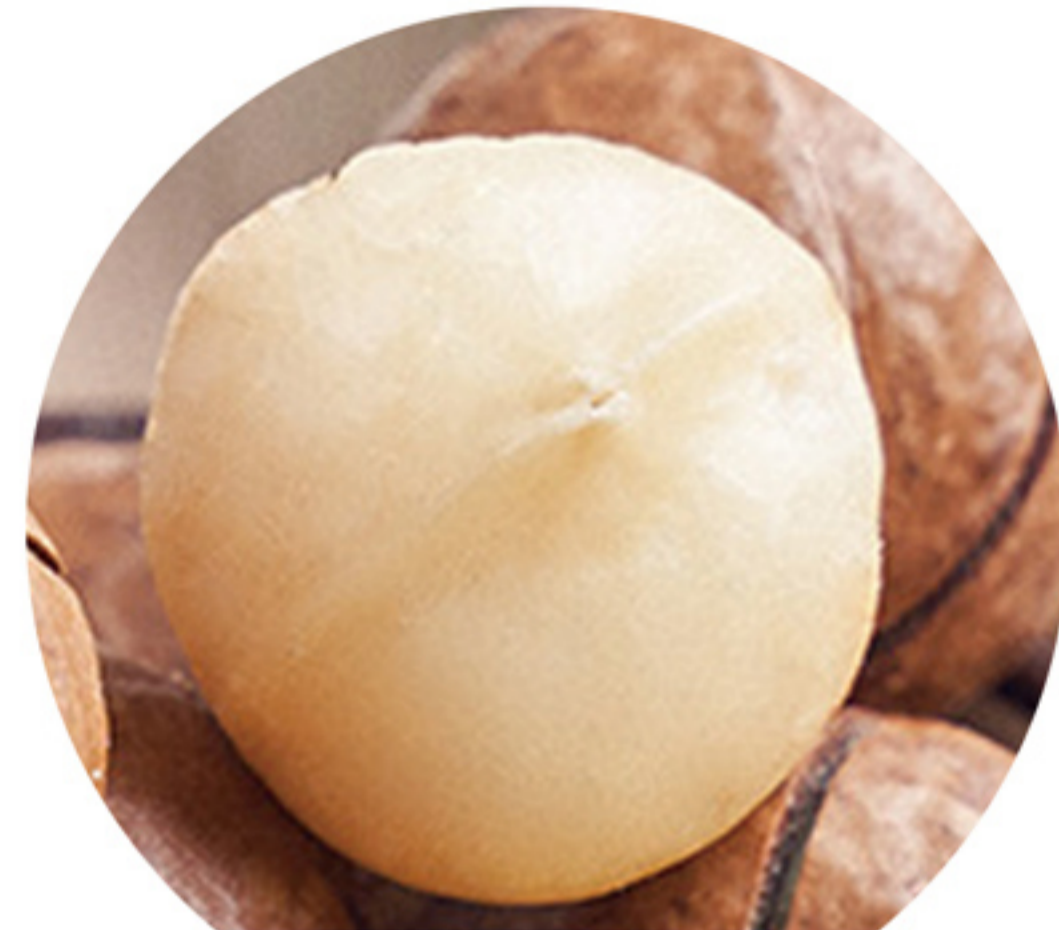
Strictly selected diameter

AGOLYN strictly follows the national production process standards and uses good raw materials.