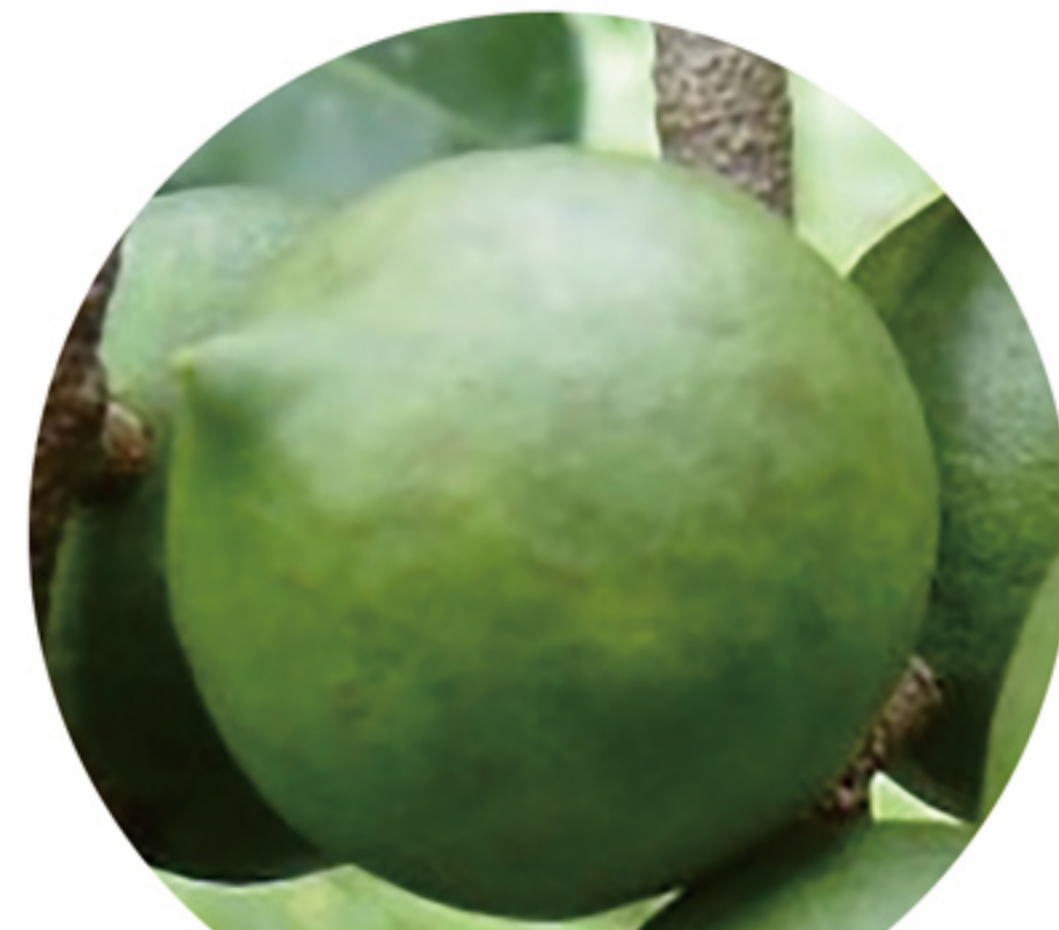
Own planting base fresh raw materials

Advantageous producing area, China is already the largest producer of macadamia nuts in the world. The planting area in Yunnan Province alone accounts for 57% of the total planting area in the world, and the output also exceeds the sum of foreign countries. AGOLYN's own contracted planting bases provide high-quality products. Meanwhile we visit the world to find good sources of goods and provide high-quality macadamia.