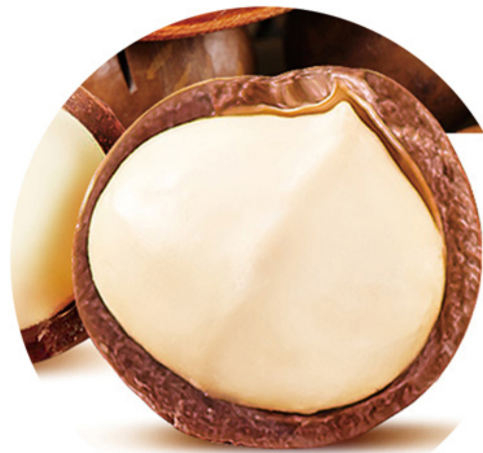
Delicious and easy to peel