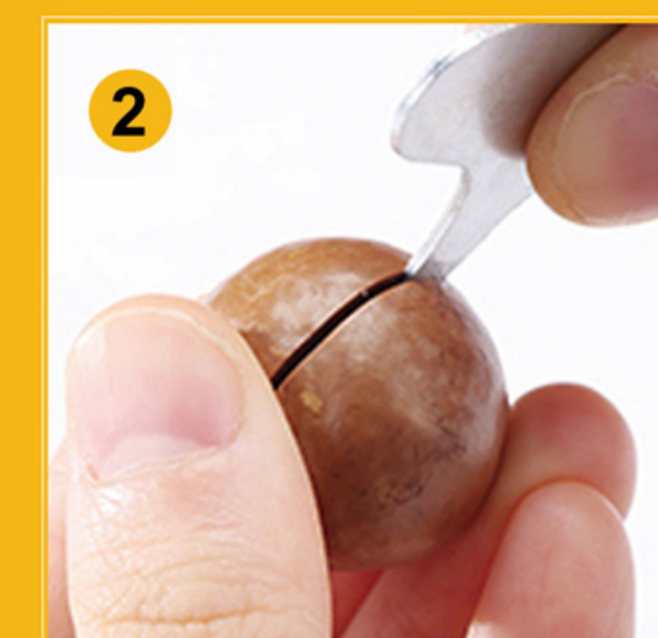
Insert from corner