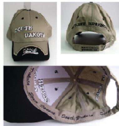
SAME AS SAMPLE