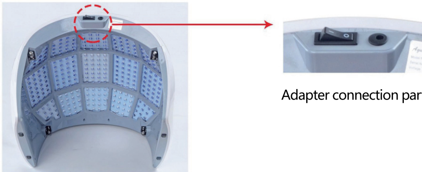
Adapter connection part

Place the ontology at the level of flat level and connect the adapter at the back end of the ontology. After connecting the adapter, press the power switch to make it from 0 to ON and to start the system.