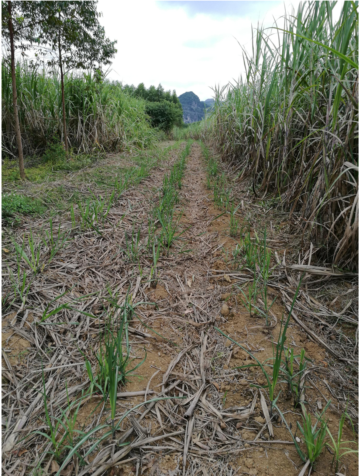
SUGARCANE NEW GERMINATING AFTER HARVESTING

E-mail:sale@tagrm.com Mobile:86-18070929871