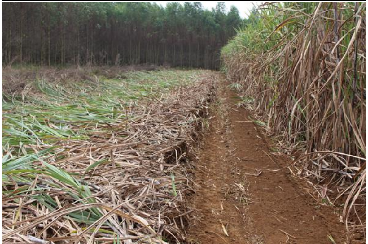
HARVESTING UNDER SOIL

E-mail:sale@tagrm.com Mobile:86-18070929871