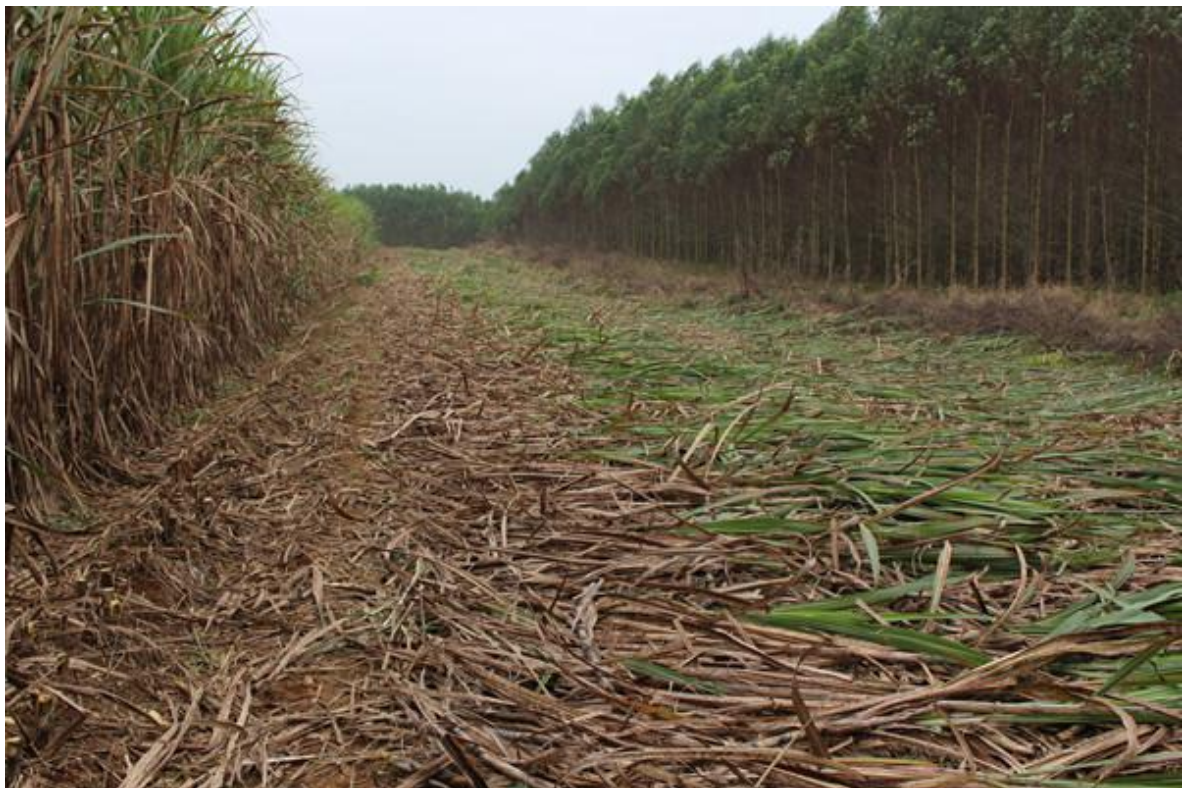
HARVESTING ABOVE SOIL