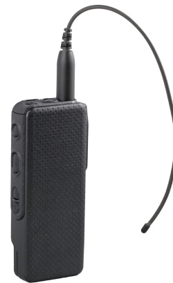
VHF FLEXI ANTENNA