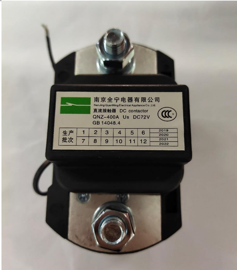
ORDER DESIGNATION (订货标记)