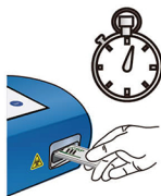
Timing the Reaction Manually