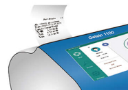
Result Show and Print