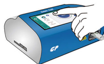
Click "Start" Icon