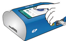
Click "Start" Icon