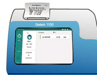
Result Show and Print