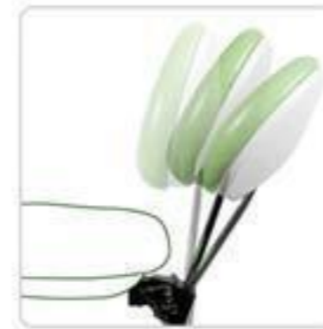
Backrest tilt adjustment