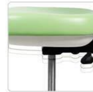
Seat height adjustment