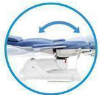
Trendelenburg Position Tilt-adjustment