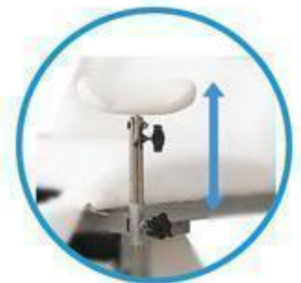
Leg Supports Height adjustment