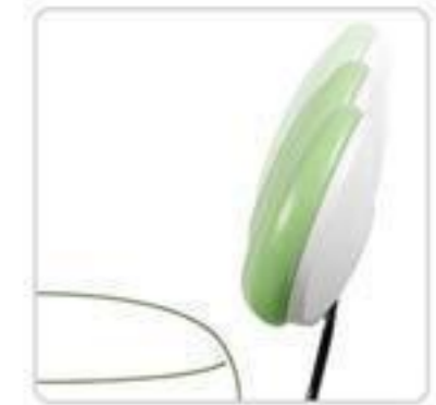
Backrest height adjustment