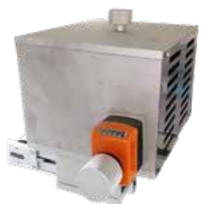
JW cap spacer