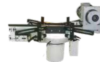
Side wall camera checking