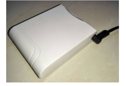
plug-holding design to make stable perfect connection