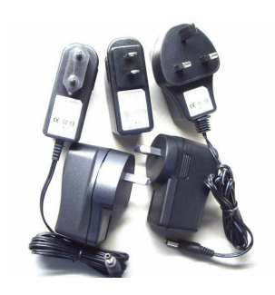
P061 Charger 4.2V 2A 8.4V 1.2A 12.6V 1A 16.8V 1A