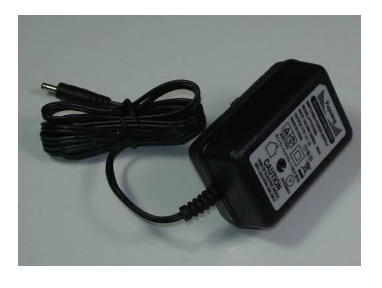
P121 Charger 4.2V 2.5A 8.4V 1.5A 12.6V 1.5A 16.8V 1A