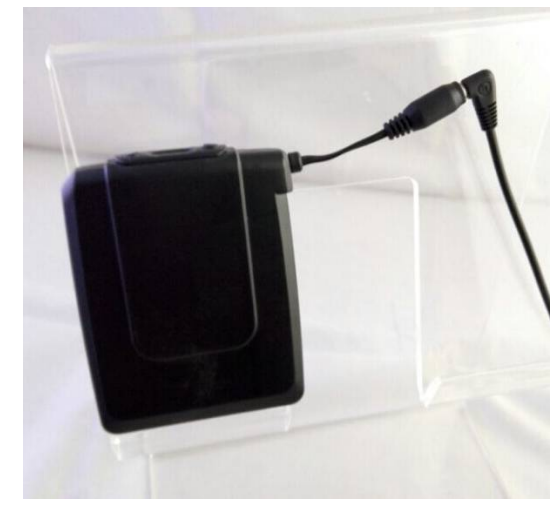
The 3.5*1.35mm DC connector could be replaced with a wire leads to get better connection in some application.