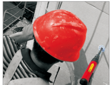
■ Easy operation, fast and efficient