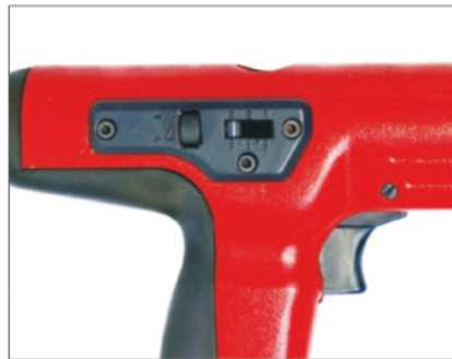
■ Power adjustable