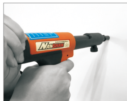
■ Lightweight, portable