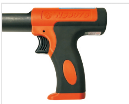
■ Simple construction, ease of disassembly