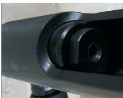
■ Automatic ejection