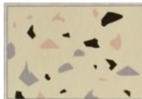
small amount effect