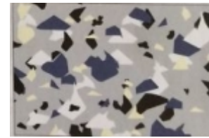
more amount effect