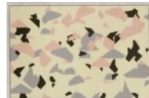
more amount effect