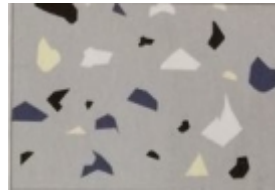
small amount effect