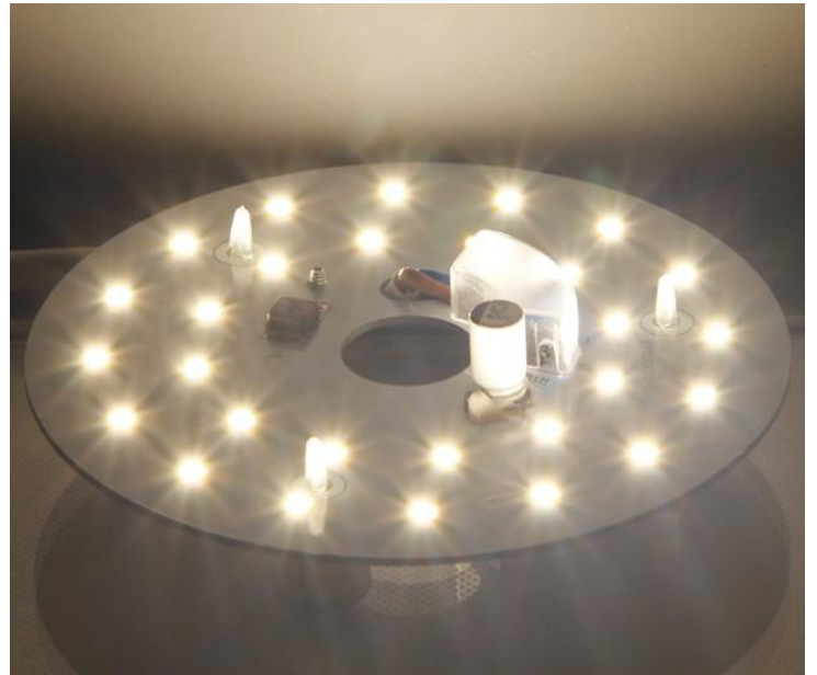
9W LED module lighting diagram