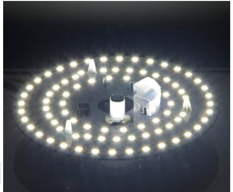
9W LED module lighting diagram