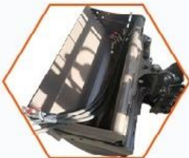
Tilting Bucket 1000mm