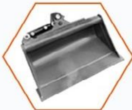
Tilting Bucket 800mm