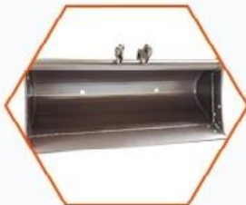
Leveling Bucket 800mm