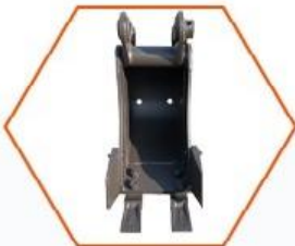
Narrow Bucket 200mm