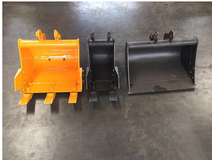
Narrow bucket 200mm: USD 60