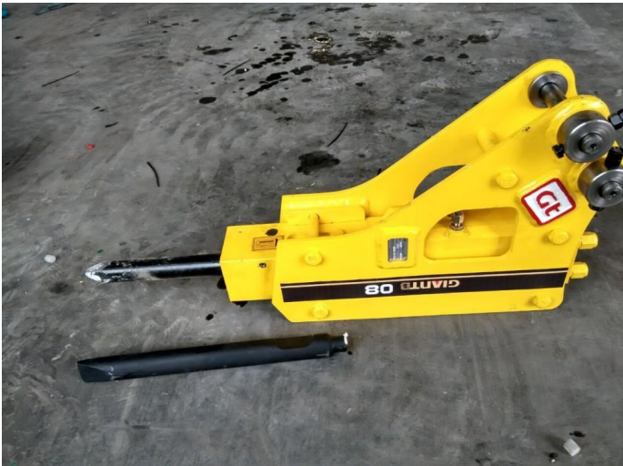
Hammer: USD 1200