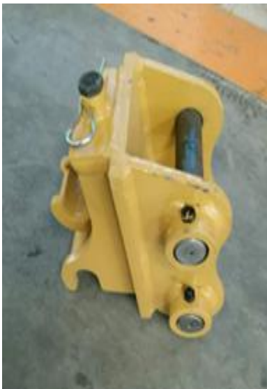
Quick hitch: USD 150