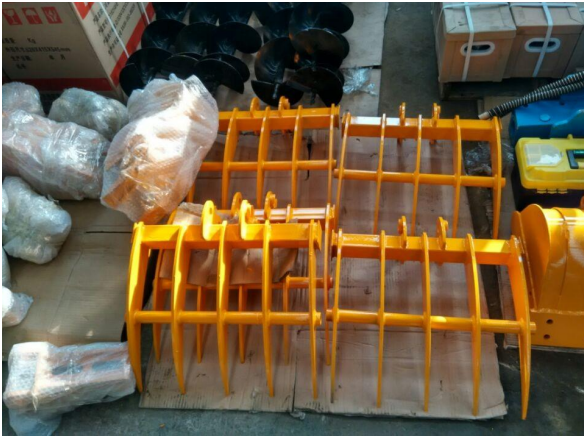
Rake: USD 60