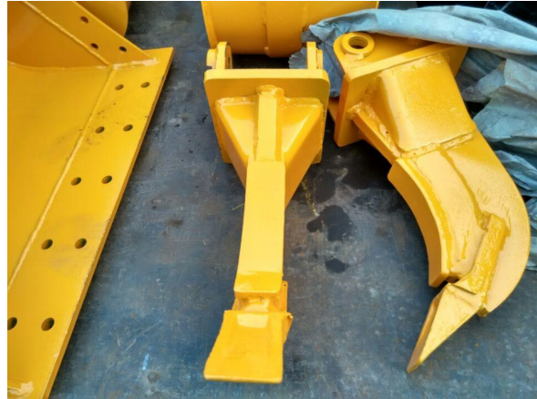
Ripper: USD 60