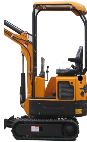
Roof cost: USD100