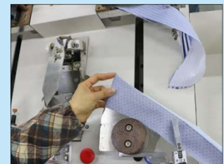
機械夾夾緊領 Automatic clamp for clamping collar tightly