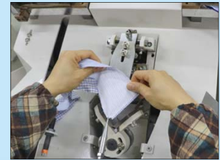
切領咀、反領操作 Collar tip trimming and turning